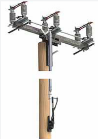
Pole Top, Side Break Switch with manual operating handle.