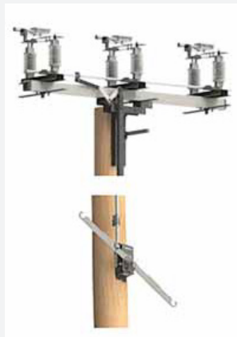
Pole Top, Side Break Switch with hook stick actuator.