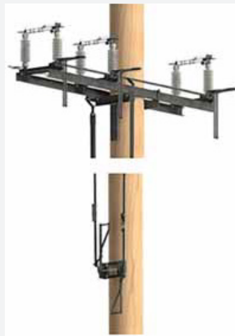
Mid Pole, Side Break Switch with manual operating handle and associated Earth Switch.